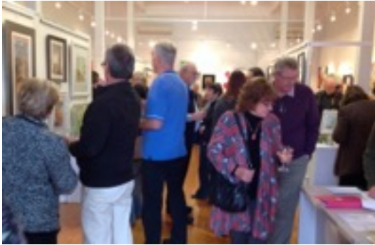
Once Upon a Time Opening